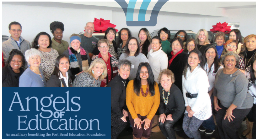
Angels of Education An auxiliary benefiting the Fort Bend Education Foundation

On November 12th, the Fort Bend Education Foundation's Angels of Education Auxiliary hosted a reception for volunteers at Audi Sugar Land. Auxiliary members were invited to get to know each other and find out about the Foundation's programs and upcoming volunteer opportunities. Harvest Market graciously provided lunch for the reception. The Angels of Education Auxiliary supports the Foundation by providing volunteers and creating community awareness.